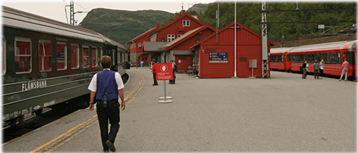
Train Myrdal - Flåm, open seating